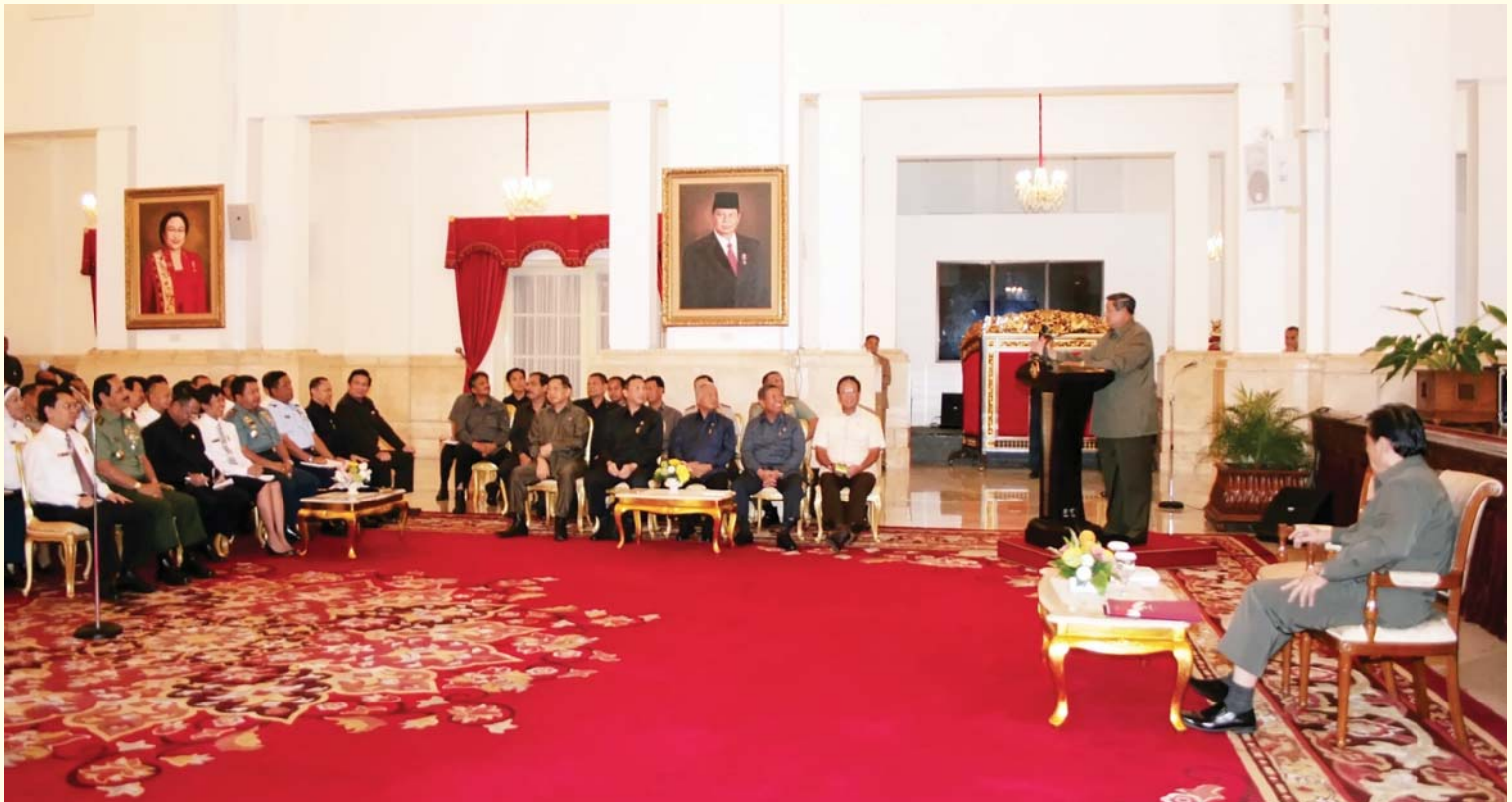
The President of the Republic of Indonesia Dr. Susilo Bambang Yudhoyono addressed his remarks in the orientation for PPSA XVI and PPRA XLIII in the State Palace on December 7, 2009.