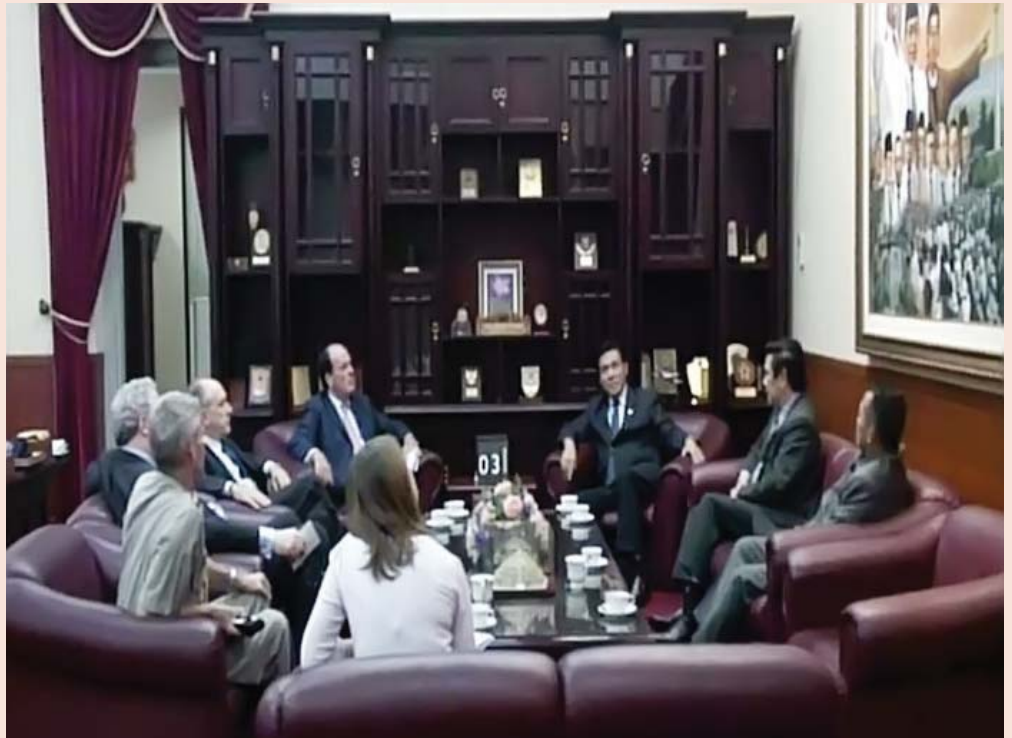
Lemhannas RI Governor was talking to the group of Minister for Defence Equipment and Support chaired by Mr. Quentin Davies accompanied by Vice Governor and Secretary of Governing Board of Lemhannas RI in Working Room of Governor