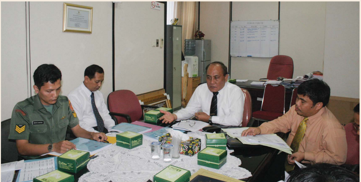
Atmosphere of Coordination Meeting of Preparation of LAKIP 2009 at the Inspectorate Room attended by Executive personnel in each work unit of Lemhannas RI

b. Annual Lakip is submitted to the President and Vice President with carbon copy to the Minister responsible for State Administration Reform (PAN) as well as to the Financial and Development Supervisory Board (BPKP).