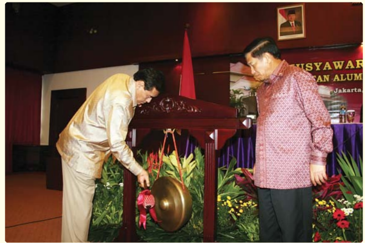
Lemhannas RI Governor Prof. DR. Muladi, SH accompanied by chief executive of IKAL General (Ret) Agum Gumelar banged the Gong as symbol of opening of 2nd National Congress of IKAL at Tri Gatra Building, 3rd Floor west of Lemhannas RI

Symbol), in the vehicle of the Republic of Indonesia (NKRI), based on Pancasila and Constitution of 1945. Keep on developing the attitude and culture of thinking as well as acting positively in all communities, nation and state's life aspect as well as always have visionary thinking, gain the better future, oriented to the universal value mission, to face the liberty, independency challenge and human rights for the safety of the Nation and State of the Republic of Indonesia, toward independency and harmony with the other advanced nations.