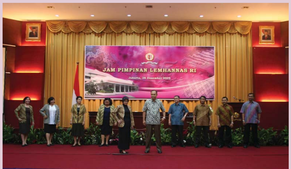
Batik clothes modeling by several staffs of Lemhannas RI

At the end of his remarks, the Governor addressed many successes already attained to date constituting the synergy and work hard of all members of Lemhannas RI. Then, Lemhannas RI Governor addressed gratitude and appreciation to all members of Lemhannas RI, as well as asked all members of Lemhannas RI to improve their respective performance based on high discipline and spirit of dedication for nation and state's interest. As the additional program, it was presented oration of Indonesian batik appreciation and batik clothes modeling by 10 members of Lemhannas RI.