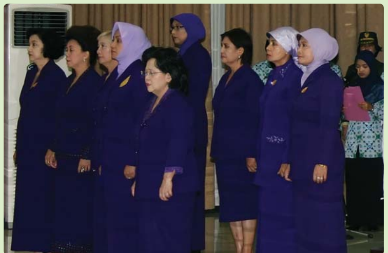
The chairman and management of Dharma Wanita Lemhannas RI follow Mother's Day commemoration ceremony to 81 December 22, 2009 at Dwi Warna Purwa Building, Lemhannas RI

Subsequently, the gender perspective should also be integrated in fulfilling the female's right to the ownership of land and other property, eradicating the violence against female and child including in conflict situation as well as increasing the female participation in the public space in every level. To overcome the problem above, there should be support from all parties. So by the spirit of this Mother's Day, the State Minister for Human Empowerment and Children Protection wanted to appeal all parties to cooperate and integrate their commitment as well as spirit to eradicate all types of discrimination by gender and eradicate all types of violence against female together with the male in all other community's elements. Without strong cooperation and commitment, it is impossible to materialize the gender justice and equality as an effort to create democratic, just and peaceful Indonesia.