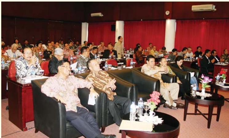
Atmosphere in 2nd National Congress of IKAL attended by Top Officials of Lemhannas RI, Structural Official of IKAL and other Participants of IKAL National Congress 2 when listening the remarks from the Chief Executive of IKAL.

According to the theme of National Congress 2nd of IKAL, it is the right time to formulate the strategic policy to re-strengthen the togetherness, cohesiveness and solidity bond, national unity and integrity, above the Bhineka Tunggal Ika (One in Diversity