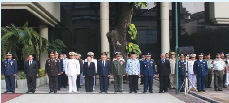
The High Officials of Lemhannas attended Ceremony of Indonesian Archipelago Day

But by the preserving struggle and long and tough diplomacy, finally the conception of Indonesian Archipelago was accepted and stipulated in