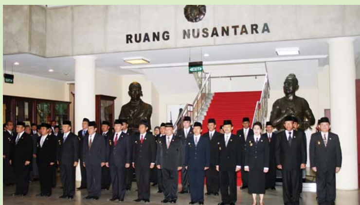
Ceremony of Position Acceptance of Echelons I,II,III,IV carried out in Nusantara Room

To the officials honorably dismissed due to reaching the pension age, I addressed my gratitude for all dedications they contributed currently in Lemhannas RI.