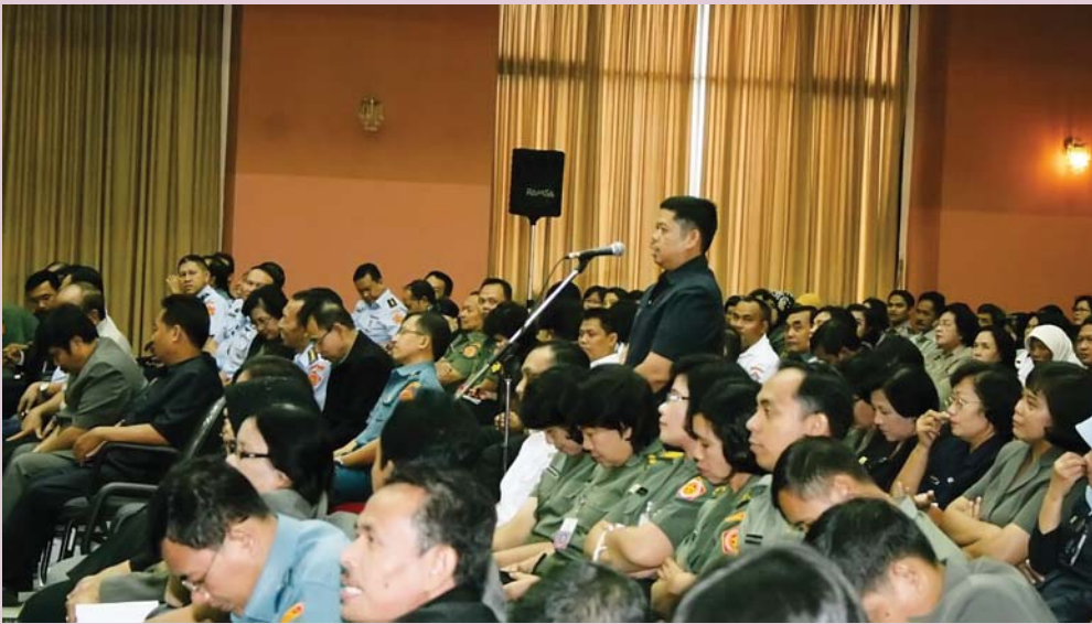
One of staffs of Lemhannas RI asked in question-answer session after direction from Lemhannas RI Governor finishes

or resilience sectors. This ICT Model in 2010 will be continuously developed.