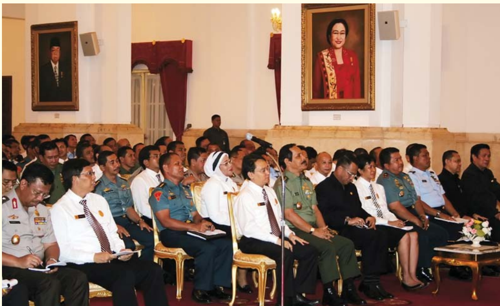
Atmosphere when listening to the orientation by the President of the Republic of Indonesia in the State Palace on December 7, 2009.

the greatest threat in materializing energy resilience is volatile and continuous increase in price of oil and gas based energy (biofuel) thereby requiring subsidy from the government to secure its availability, affordability and acceptability. At the end of his remarks, the President of the Republic of Indonesia DR. Susilo Bambang Yudhoyono addressed, "As the national level management, you are demanded to actively take part in overcoming the corruption eradication problem and able to overcome the energy crisis and I hope that the knowledge as well as insight gained during the training is able to be applied in the task in your respective field". On those occasion, the President of Republic of Indonesia also needs that Lemhannas RI in 2010 could organize a seminar about Economic condition of Indonesia after global economic crisis.